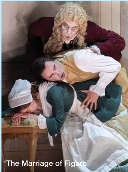
'The Marriage of Figaro'