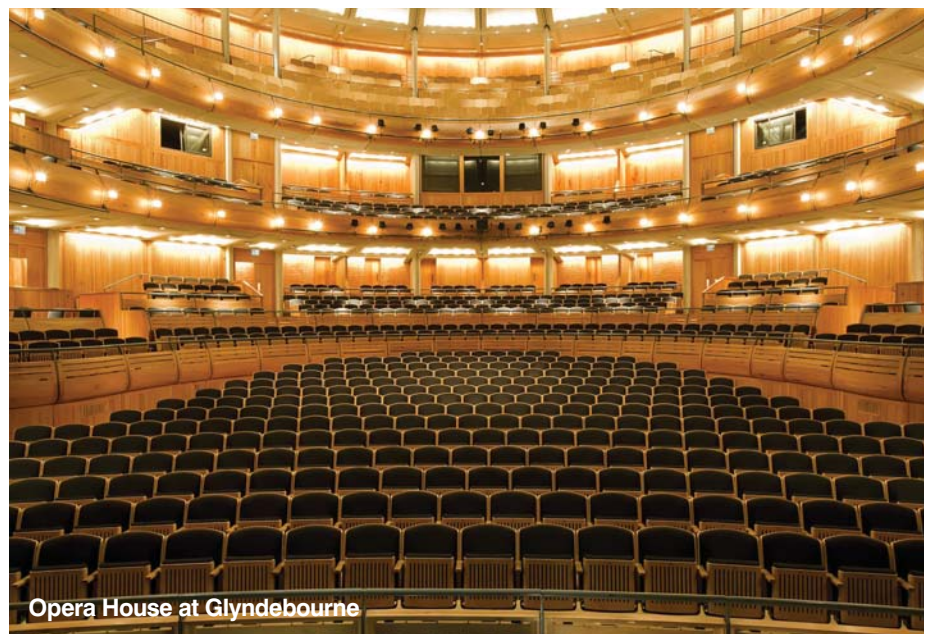
Opera House at Glyndebourne

NB:- Please note we reserve the right to alter the above itinerary if required for operational reasons. Given the historic nature of the places visited, a certain degree of walking will be involved, and this holiday may not be suitable for those with mobility problems.