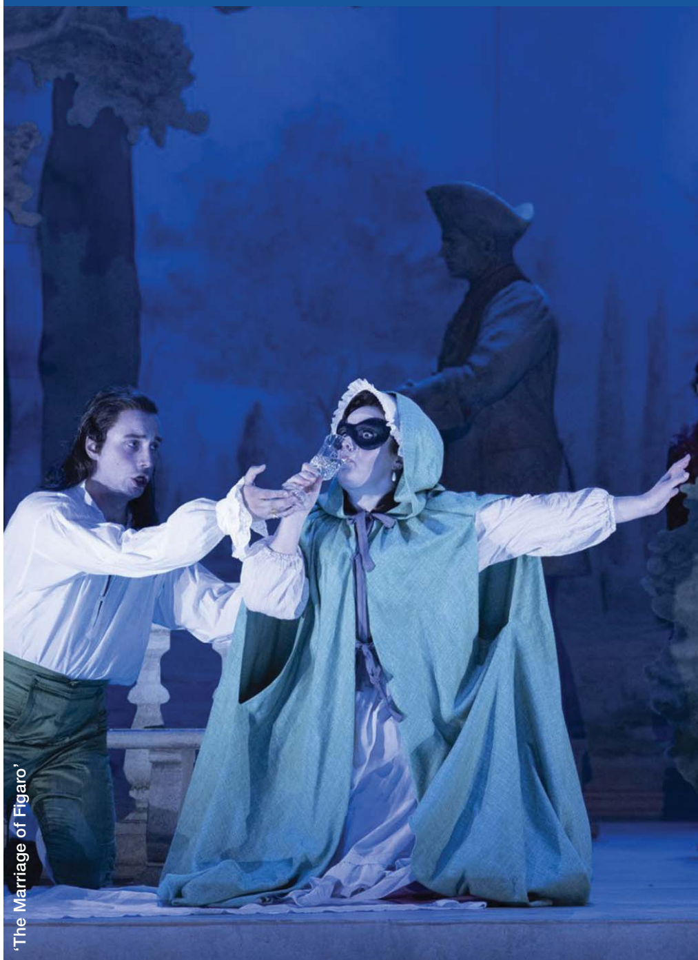
'The Marriage of Figaro'

3 days from £699 Departing 26th October 2026