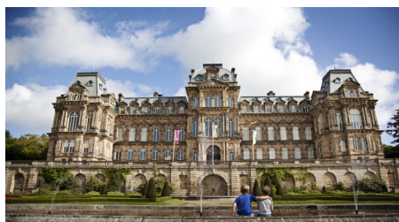
The Bowes Museum