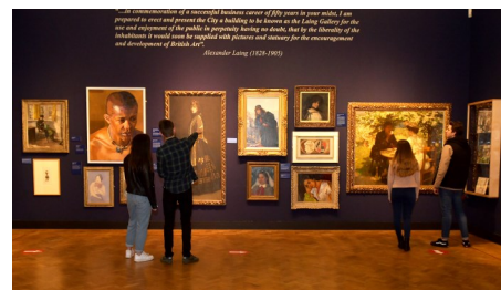
Laing Art Gallery